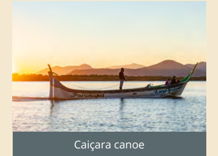
PROTECTED AREAS AND FULL NATURE

for the balance of the planet and for future generations. It argues that tourism can be a positive economic activity when carried out responsibly and sustainably, and can enable a restorative economy and improve the quality of life of dozens of traditional and historic communities. This work offers a unique opportunity for the conservation of one of the most important biodiversity areas in the world. The Atlantic Forest is Brazil's heritage and needs to be valued, recognized and preserved by everyone.